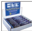
Pop-Up Cardboard Display Carton

QuikCopper is available in 3.5" (2 oz) and 7" (4 oz) lengths. Individually packaged in a reusable clear plastic tube with trilingual (English, Spanish, French) instructions and plastic friction top. The display carton holds 12 or 24 - 3.5" sticks or 12 - 7" sticks (packed 2 display cartons per master carton), or bulk-packed 24 sticks per shipper carton. Display cartons are also sold separately for refillable, point-of-purchase display. 3.5" sticks are also available in blister packs (12 per carton); printer minimum applies. Contact Sales for acrylic display rack supplier information.